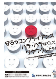
Compliance slogan poster